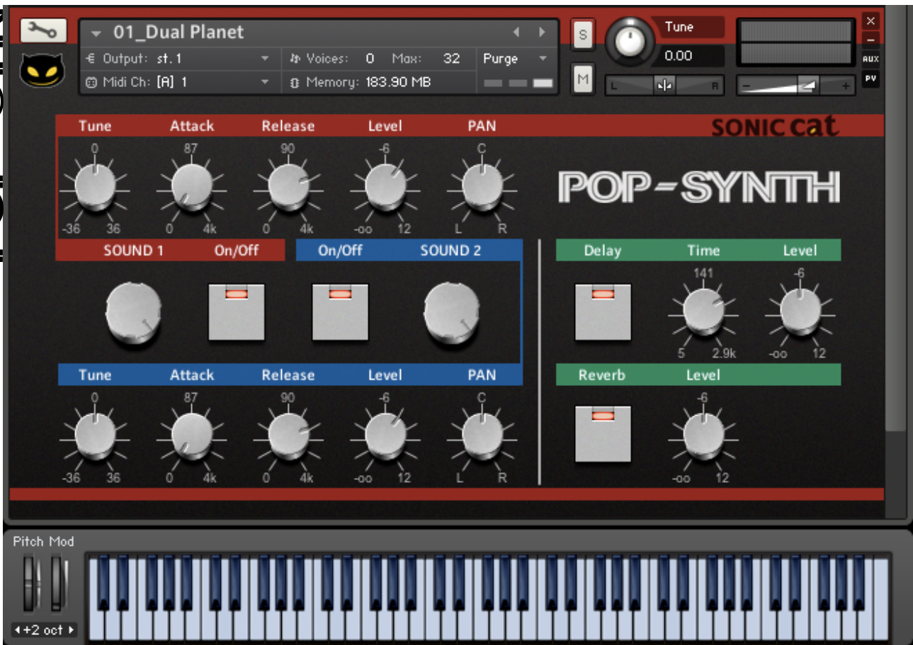
< Main UI >